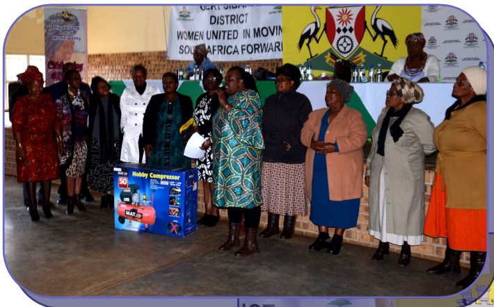
Gert Sibande District municipality hosted honoured and celebrated Women of Dipaleseng

Our aims efforts in improving the lives of our community remains unquestionable even amongst the rising